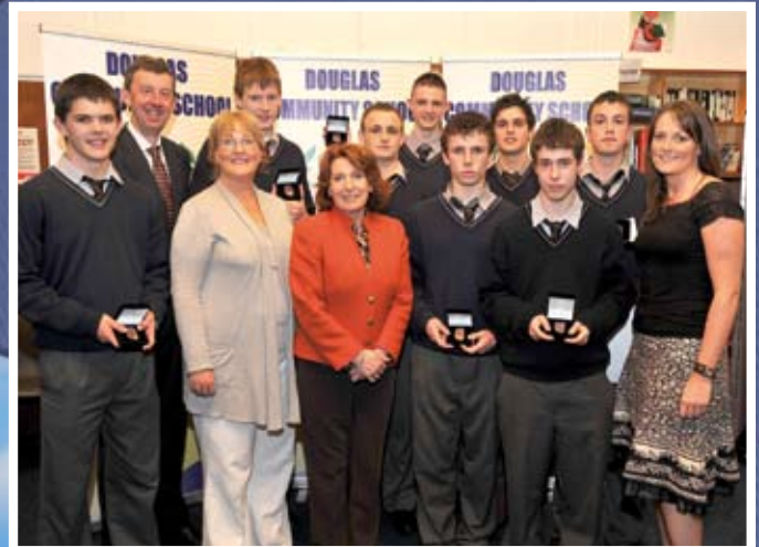
President's Gaisce Awards