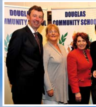
Best Junior Certificate – Sha...