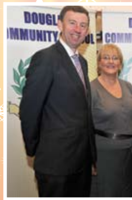
Second Year Nominee