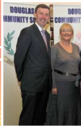
Log on Learn